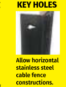
Allow horizontal stainless steel cable fence constructions.