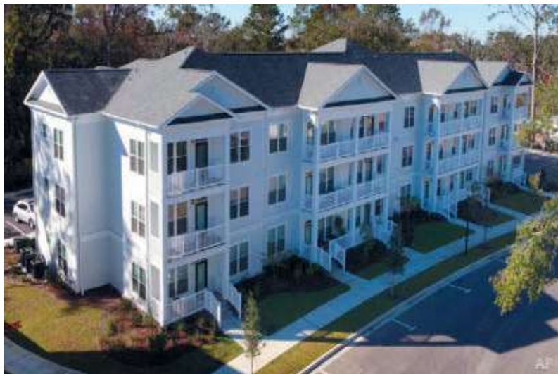
Bluewater at Boltons Landing.

"It's a true, garden-style community, and our vinyl really looks good in that sphere, but the important thing is that we could come back here in 20 years and that vinyl is going to look just as good, just as clean, as it does today."